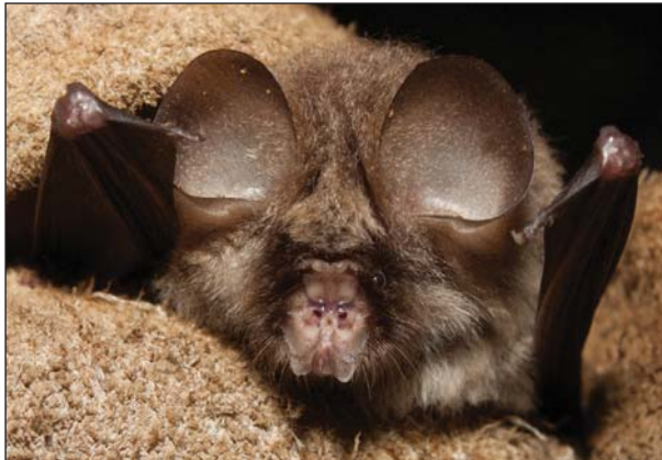
Fig. 4 Coelops frithii : CBC02138, Phnom Kulen National Park (© T. Yon).