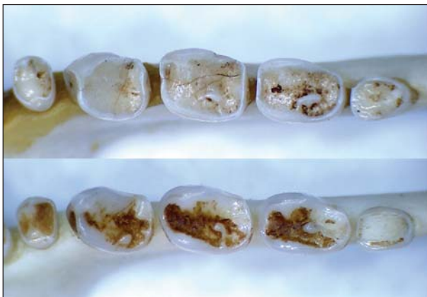
Fig. 6 Right lower tooththrows of Cynopterus horsfieldii (top: CBC00453, Phnom Tbeng; below: CBC01046, Phnom Penh).