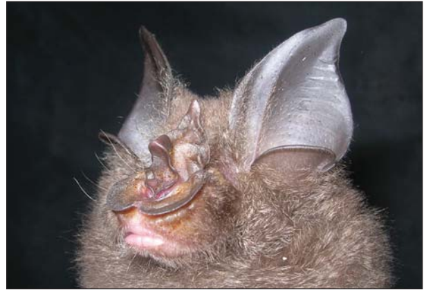
Fig. 3 Rhinolophus pearsonii : CBC02161, Bokor National Park.