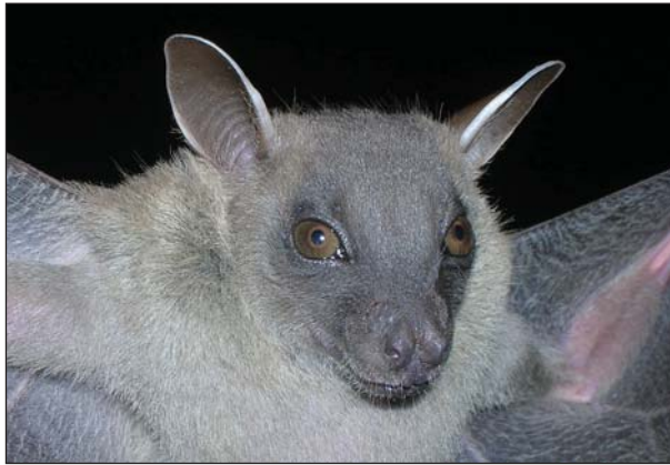
Fig. 2 Cynopterus horsfieldii : CBC01126, Veun Sai Proposed Protected Forest.