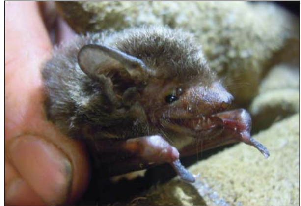
Fig. 5 Falsistrellus affinis : CBC02133, Phnom Kulen National Park.